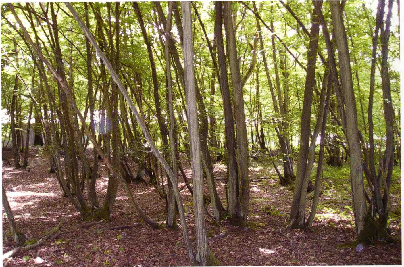
View 5, A typical view of Crowhurst Wood, ancient woodland south of proposed lorry park