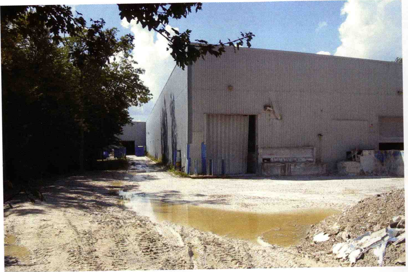
View 7, Eastern end of factory with existing road access