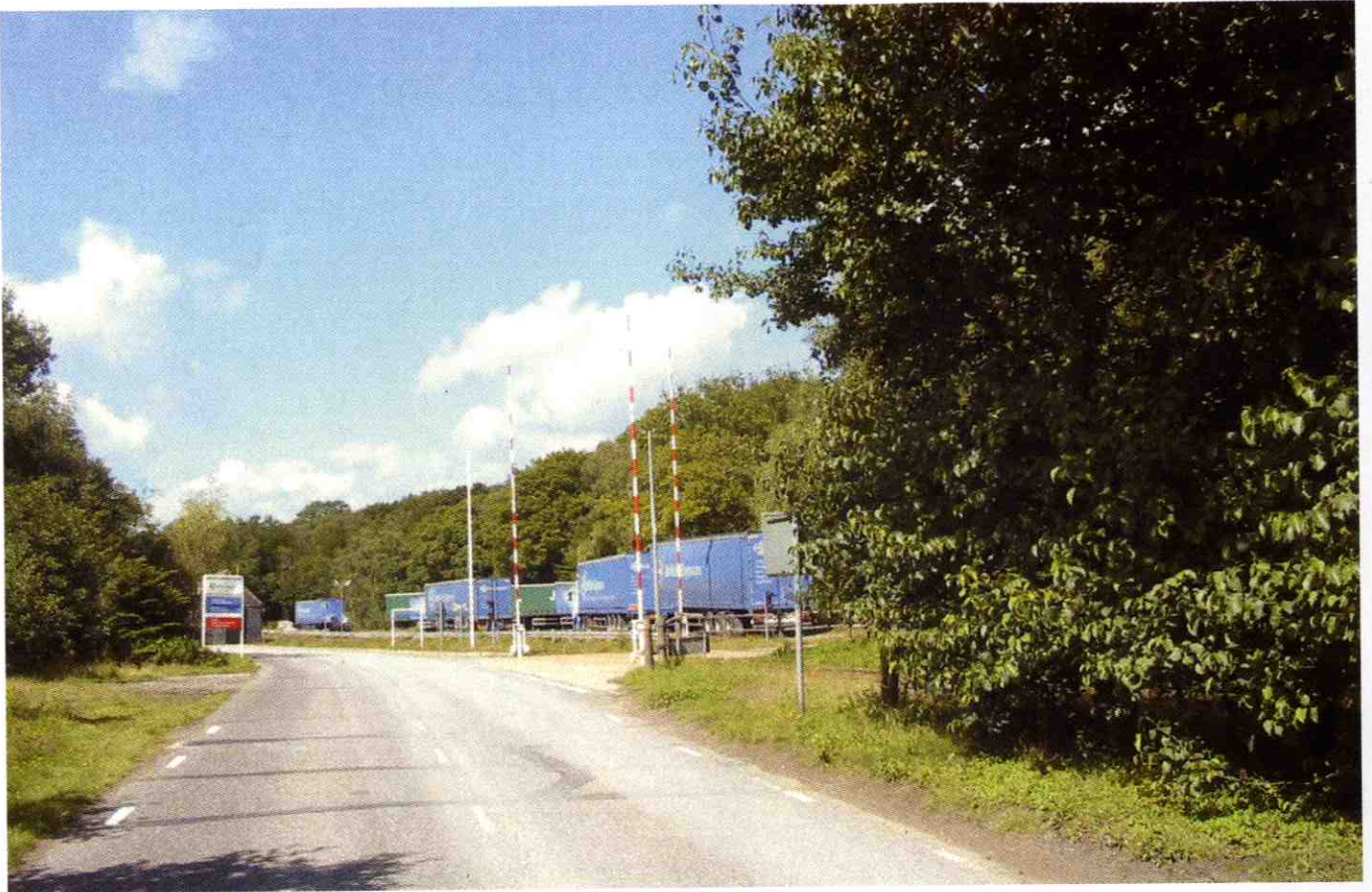
View 1, Eastern approach to the site