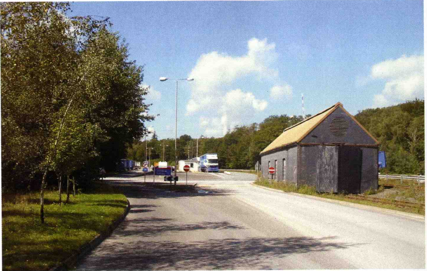
View 3, Gatehouse and weighbridge at eastern entrance