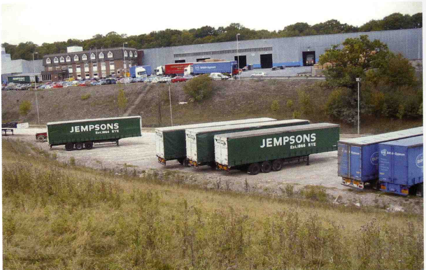
View 12, View north from old land fill site, to factory