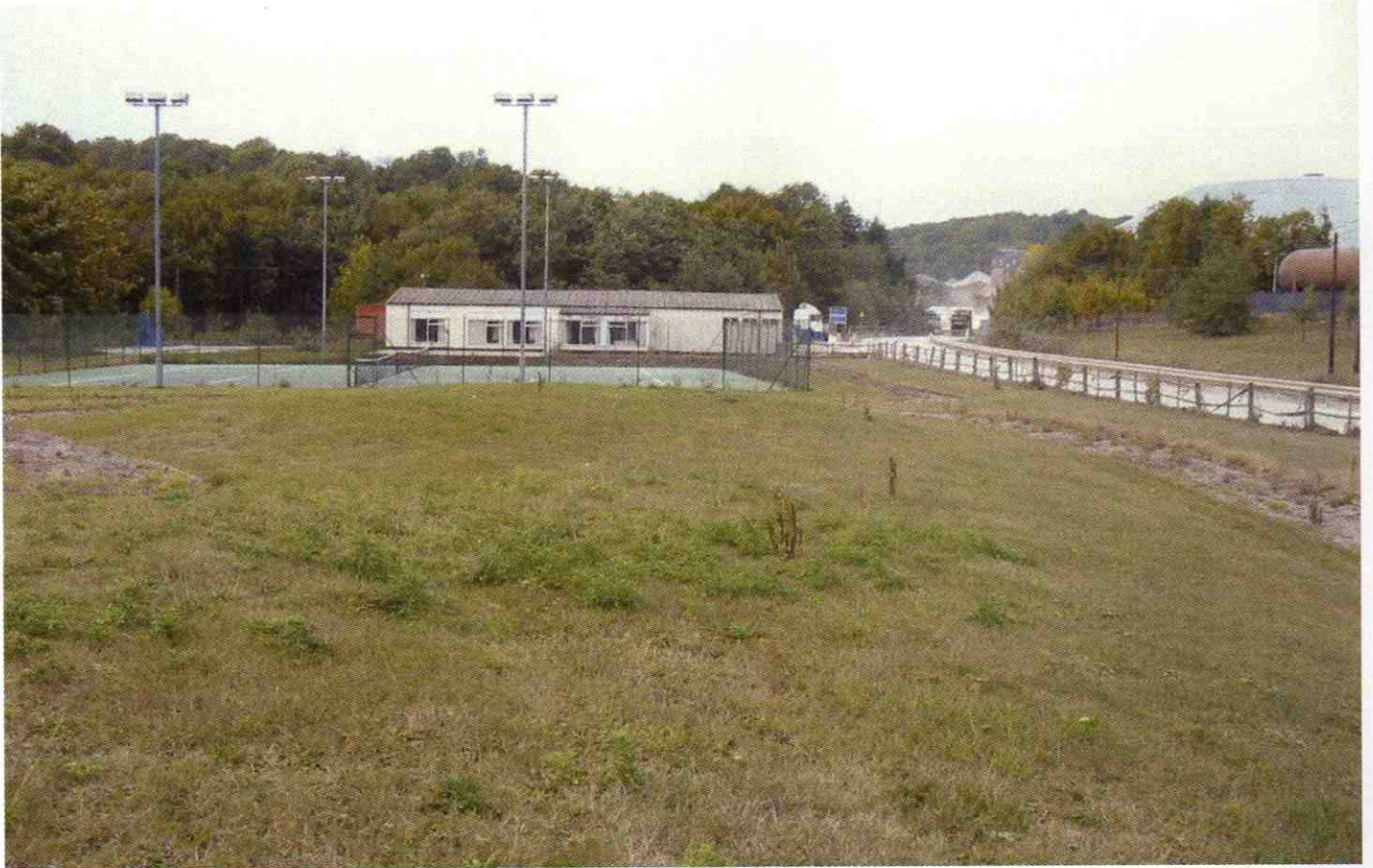
View 13, View west across tennis courts to social club, area of proposed meandering river course