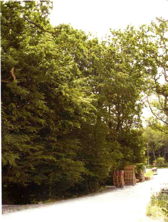
View 4, Trees to be lost by construction of access to lorry park