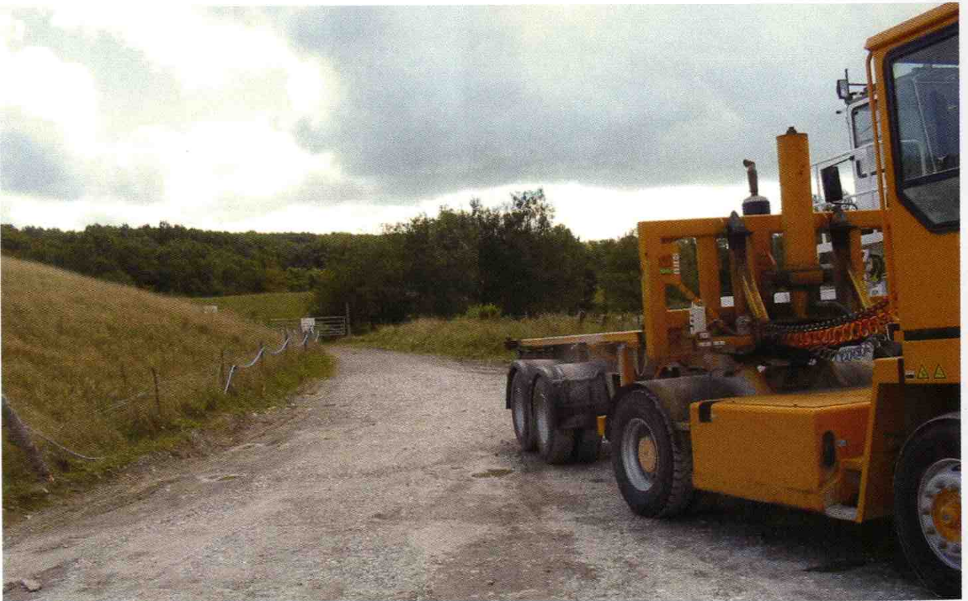
View 14, Access to south tributary