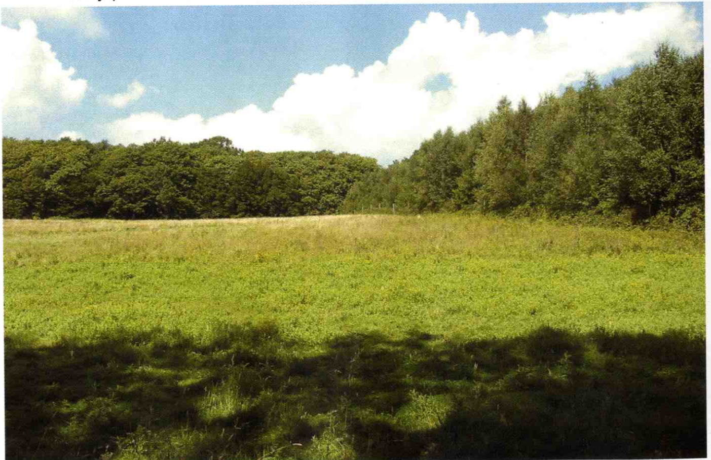
View 6, View of field to east of factory from ancient woodland to south