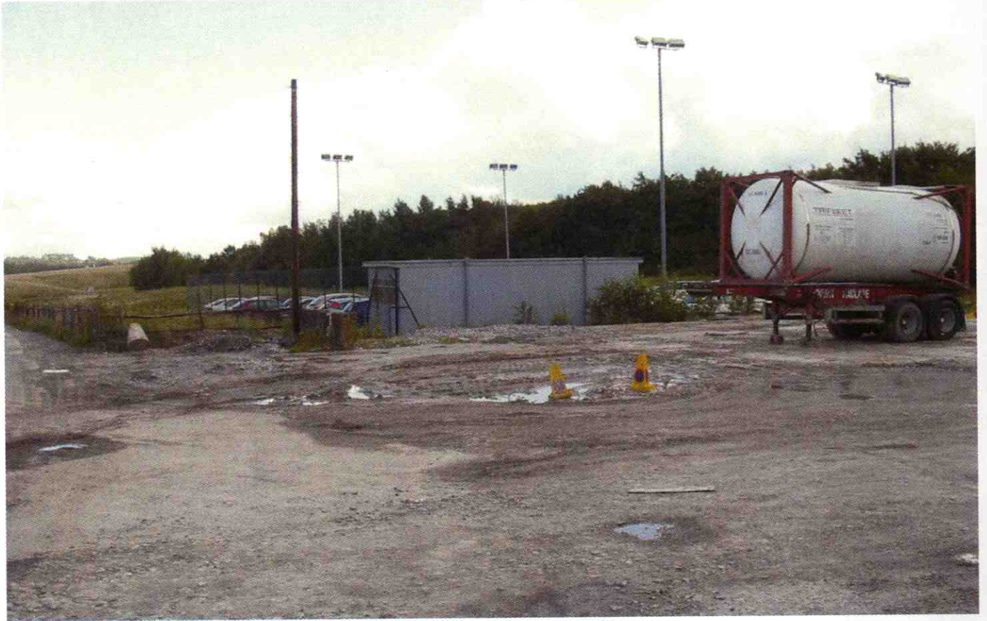
View 15, View east across site from social club