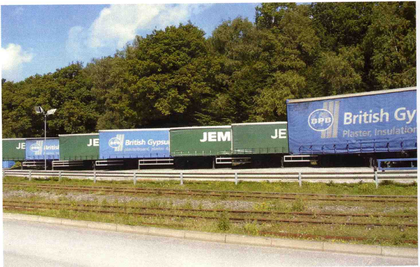
View 2, Existing lorry park by gate house