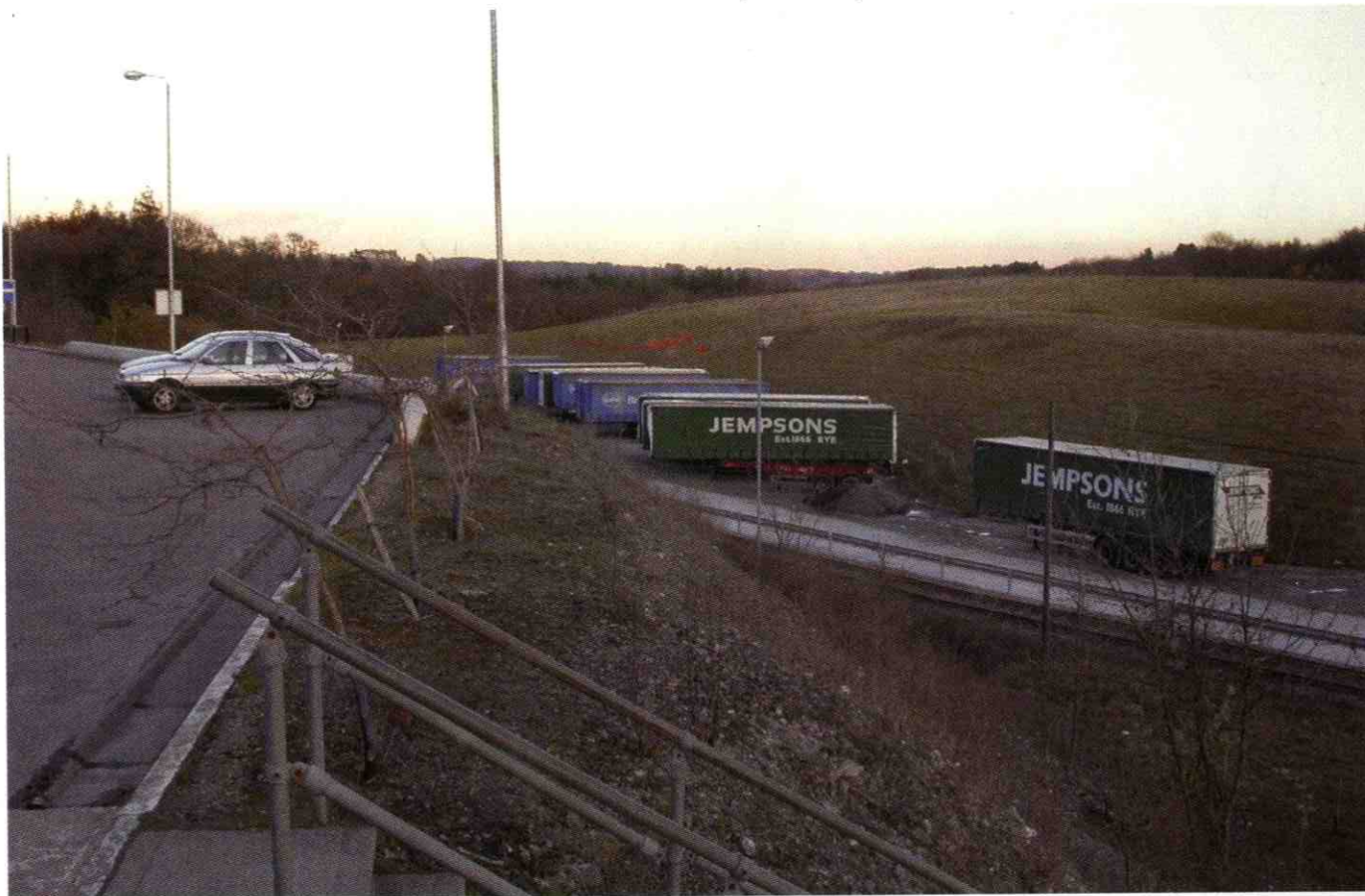
View 9, View from car park to lower road and lorry park