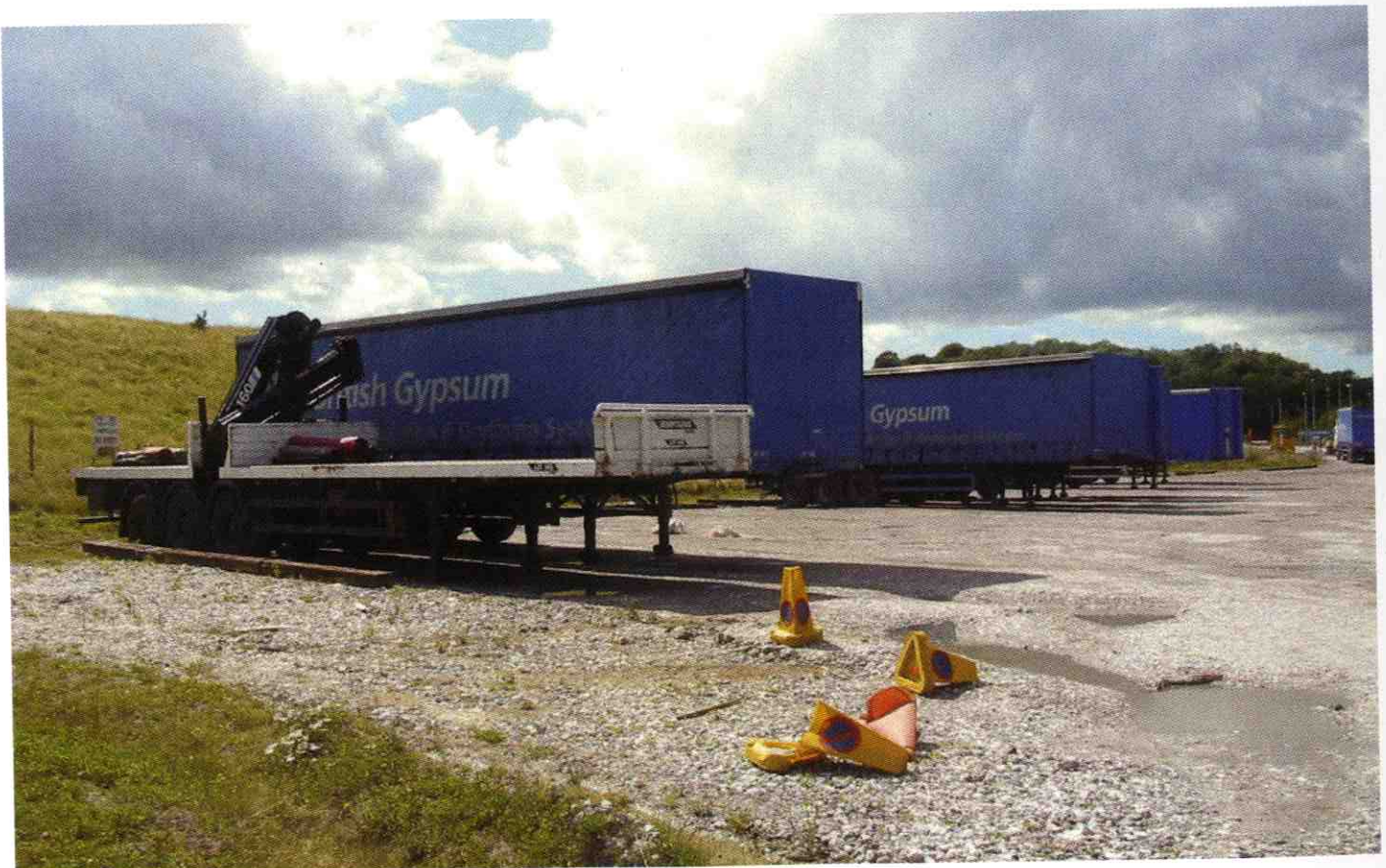
View 8, Lorry parking area next to landfill site, to be abandoned