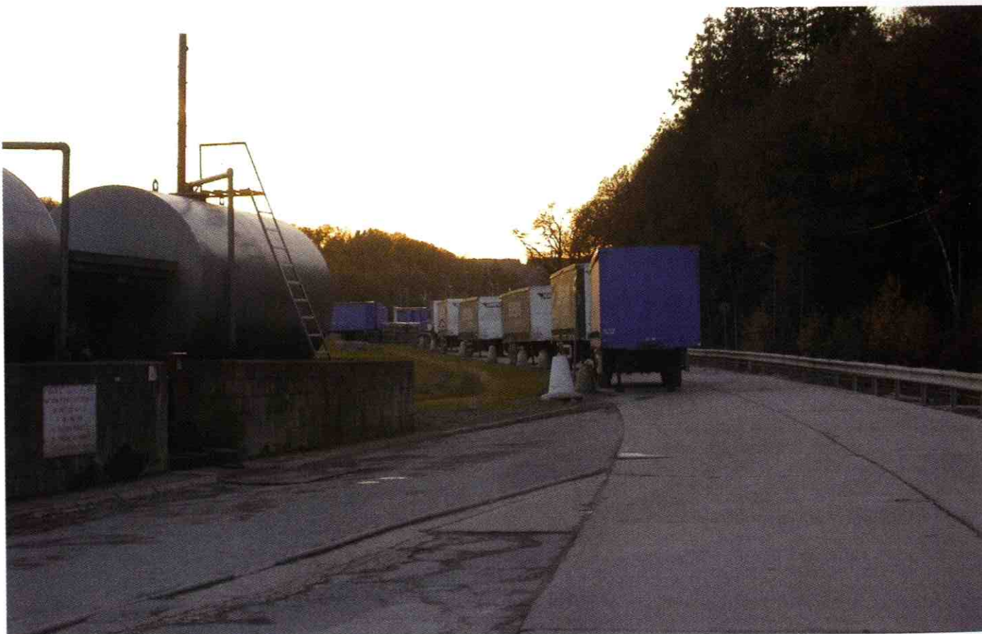
View 10, Lorries parked using lower road