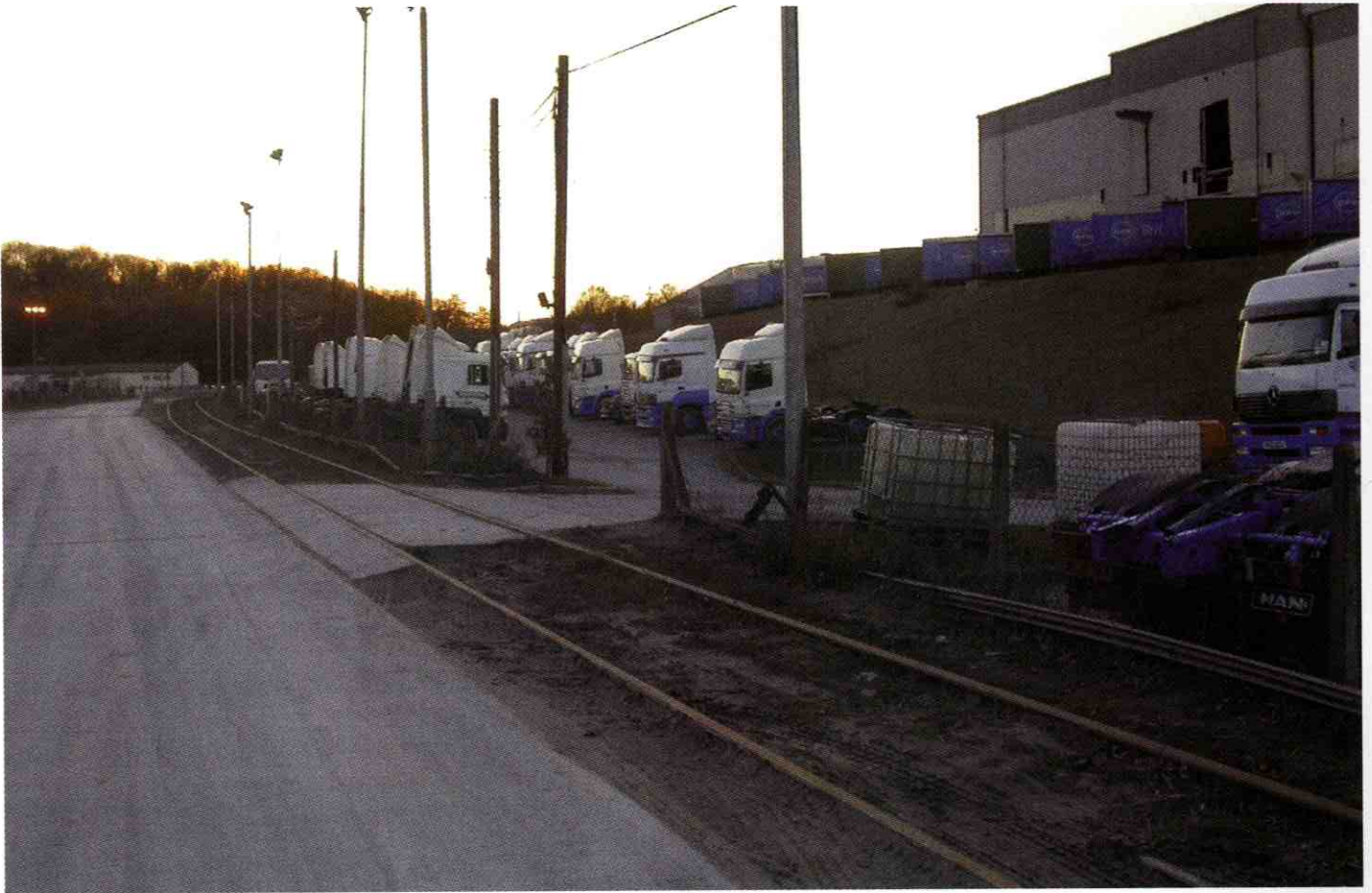
View 11, Lorries on lower lorry road area